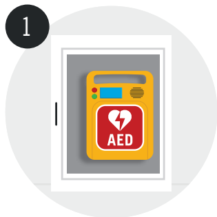
1 Locate an AED.